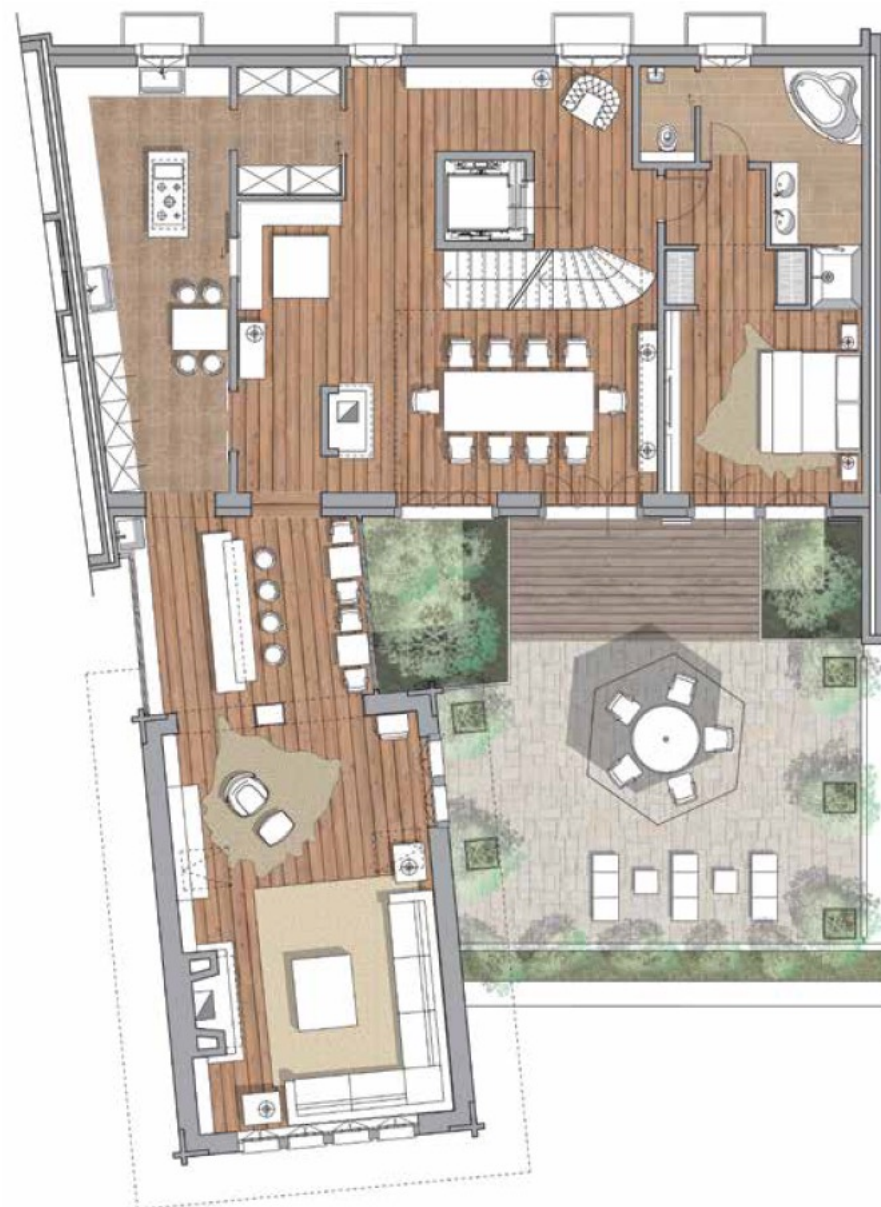
2 nd floor: lounge • dining-room • kitchen • bar • wine cellar • bedroom with bathroom • large terrace