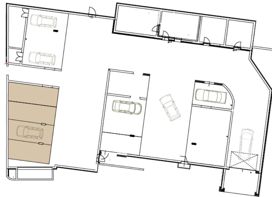
4 parking places