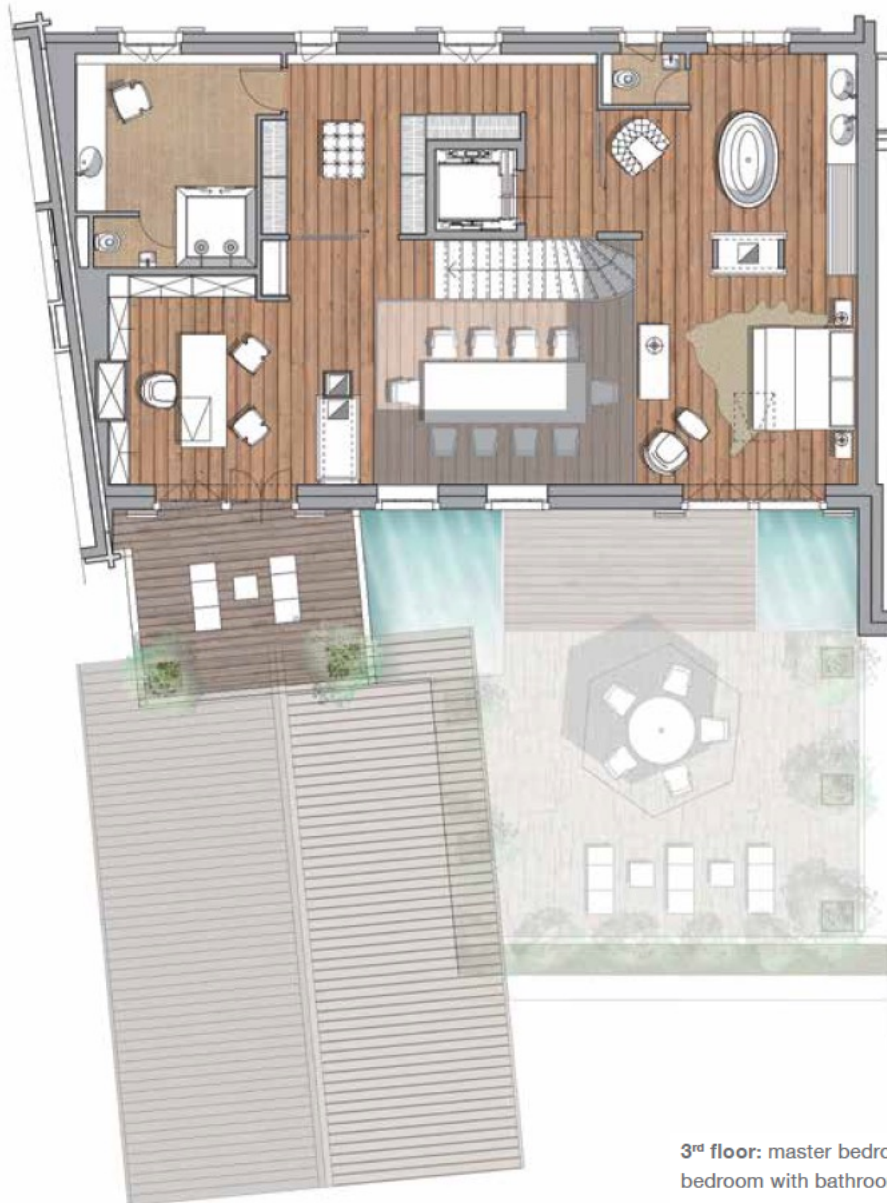
3 rd floor: master bedroom • bedroom with bathroom • terrace • possibility of 2 bedrooms with 2 bathrooms and walk-in closet