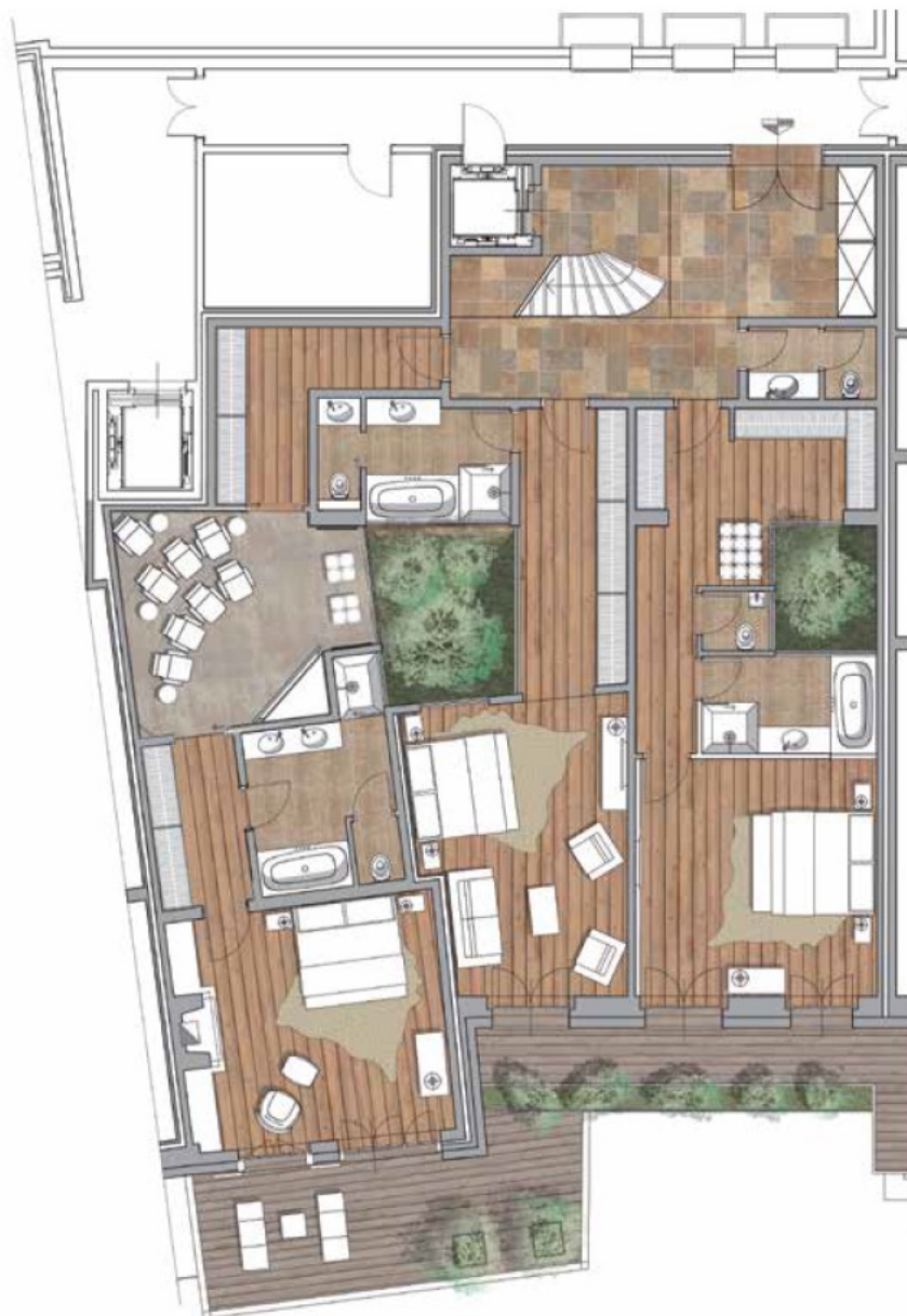
1 st floor: entrance hall with cloakroom • lift • guest toilet • 3 bedrooms with bathrooms • cinema lounge • wells of light