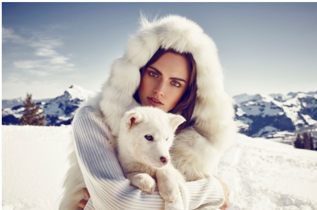
CONNECTING TO NATURE