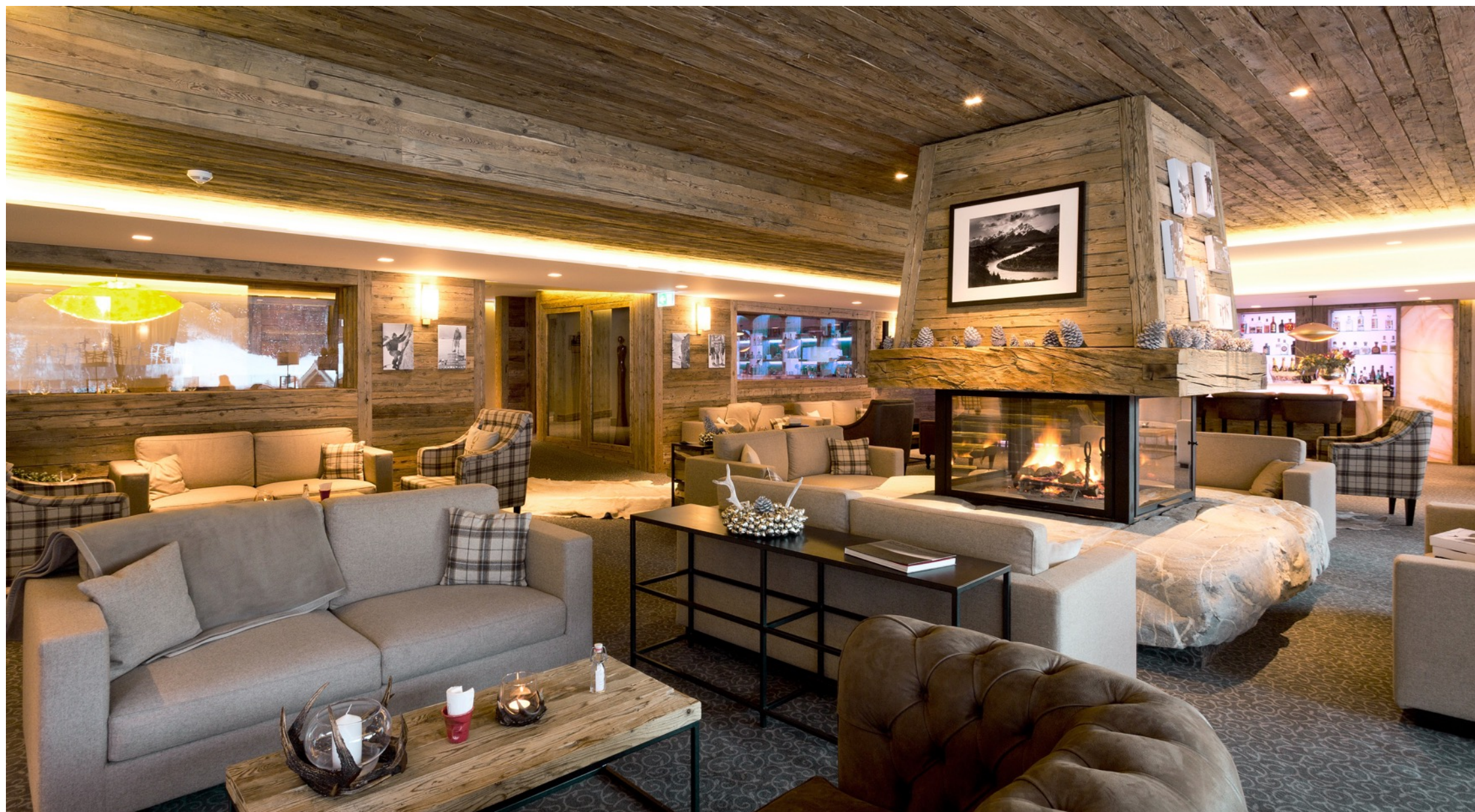
HOTEL DE ROUGEMONT LOUNGE BAR